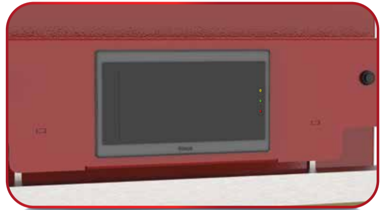
User-friendly touchscreen control panel