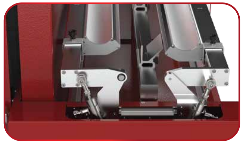
Uniform scoop coater pressure ensures a smooth, even coating of emulsion on the screen