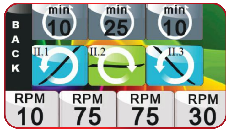
Easily program mixing time, direction and speed