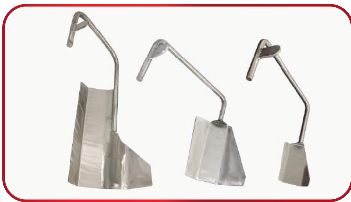
Different blade sizes: 5-gallon, gallon and quart