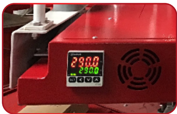
Digital temperature controls