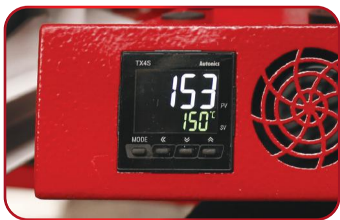
Digital temperature controls