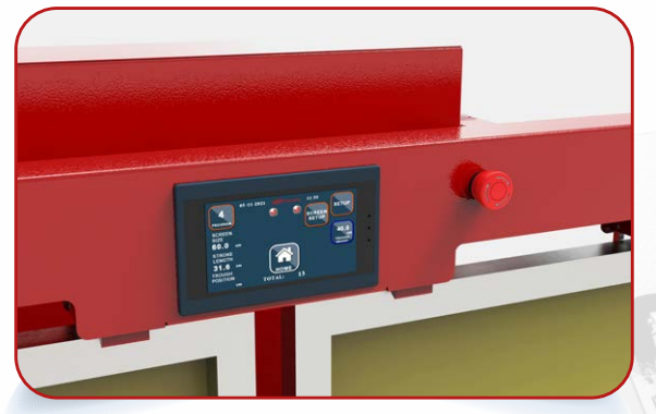
User-friendly touchscreen control panel