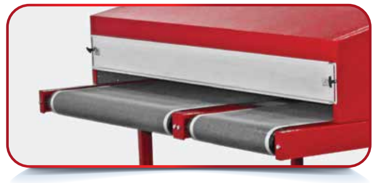
Optional split belt