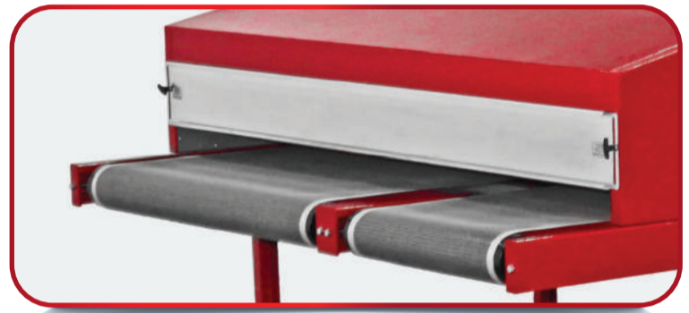
Optional split belt